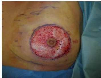
Areola resized and surrounding skin removed