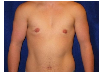
3 months post-op

Some small breasted patients can have an even more limited procedure where only a partial incision is made around the areola. This ensures the blood supply to the nipple but does nothing to take up any loose skin that may result from the subcutaneous mastectomy. I recommend this only for very small breasted patients with