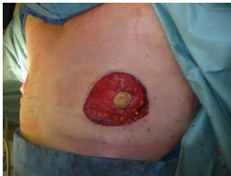
Breast tissue now gone