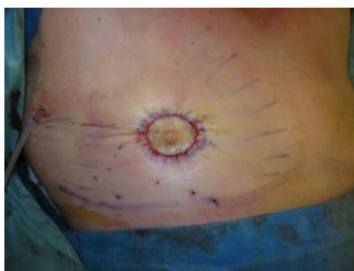
Purse string closure of skin to smaller nipple