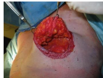
Subcutaneous mastectomy performed